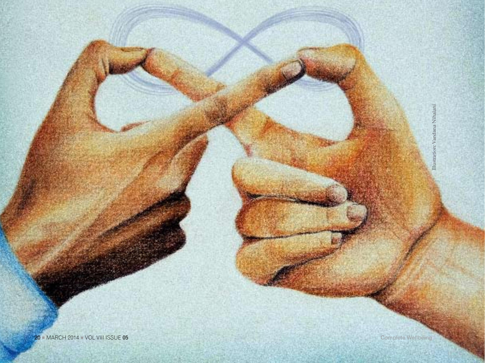
Illustration: Vandana Nihalani